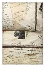
Love Letters Sheet Set