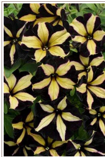
Petunia 'Black Velvet'

Back on-screen—and soon to be on Broadway—the newly single Halle Berry gives Jonathan Van Meter a glimpse of her surprisingly grounded L.A. life.