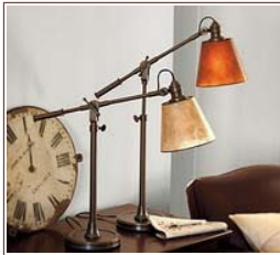
Hayes Mica Task Table Lamp